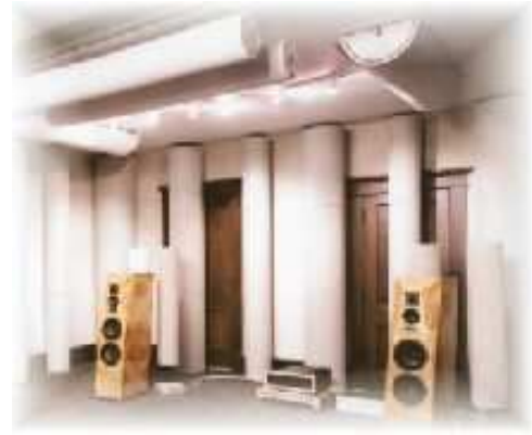
Figure 1. ASC's Tube Trap™ installed in a listening room

Considering the ineffectiveness of sound absorbing material at low frequencies, coloration problem has traditionally been addressed using large bass traps, e.g., Helmholtz resonators and other devices such as Tube Trap™ made by Acoustic Sciences Corporation (ASC). Figure 1 shows a typical arrangement of using Tube Traps in a room. These passive bass treatments, are large in size and like any other passive acoustic treatment difficult to retune.