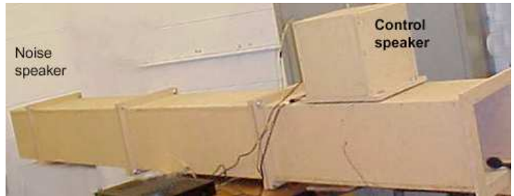
Figure 1 The experimental duct

The microphone is located on the same section, making the active system, modular. Another microphone, located outside the duct, about 1 ft away from the duct outlet, is used to measure the effectiveness of the system. Note that the 2 nd microphone is not part of the feedback system. In an experiment, the excitation (noise) speaker was driven by random noise. The active system was used to abate the low-frequency component of the noise.