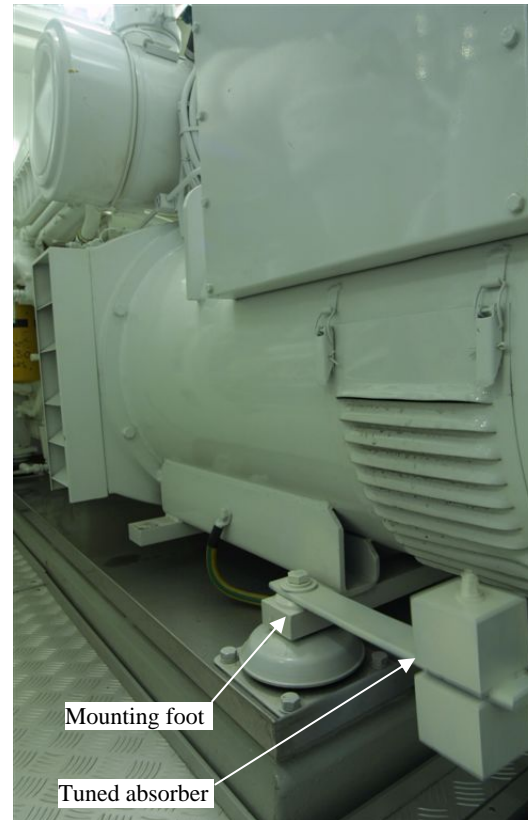
Figure 1 Tuned absorber installed on the front-left mounting foot of the diesel-generator

Prior to the installation of the tuned absorbers, acceleration power spectrum of the diesel generators at their mounting feet is measured. After installing and tuning the absorbers the power spectrum of acceleration at the same mounting locations were measured again. In addition, vibration at different locations on the boat (including the living quarters), before and after the treatment, were measured to evaluate how effectively the treatment has absorbed the vibration of the diesel generators and prevented it from being transmitted to the hull of the motor yacht. All measurements attested to the effectiveness of tuned absorbers in absorbing vibration at the target frequency of 25 Hz. For the sake of brevity, only the 'before' and 'after' measurements for one mounting foot of one of the generator sets is shown here. Figures 2 depicts these power spectrums prior to the installation of, 'before', and after the installation and tuning of, 'after', the tuned absorbers, at the 4 mounting feet of one of the diesel generators. Clear from Figures 2, the absorbers have effectively reduced the vibration power of the diesel generator, at the tuning frequency of 25 Hz. Although not presented here, the rest of the measurements indicated that vibration reduction at the tuned frequency of the absorbers (25 Hz) at the source did reduce the transmitted vibration to the hull at that frequency.