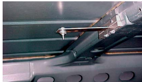
Figure 2 Tuned viscoelastic damper installed on the ceiling above the headliner

To mitigate the boominess of the cabin in a large sport utility vehicle, it was required to add damping to the 2 nd mode of the flexible roof of the SUV cabin. A small tuned viscoelastic damper (with the mass of about 30 gr) was designed and installed on the roof. A substantial amount of viscoelastic damping was engineered in the tuned mass damper for 1) avoiding splitting the target vibration mode, and 2) have tolerance to slight variation to the tuned frequency.